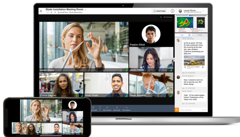
Figure 1: Avaya Spaces in action, featuring meetings and chat.

Note: Avaya offers a free version of Avaya Spaces in certain countries to try out. For more information on Avaya's solution, click here .